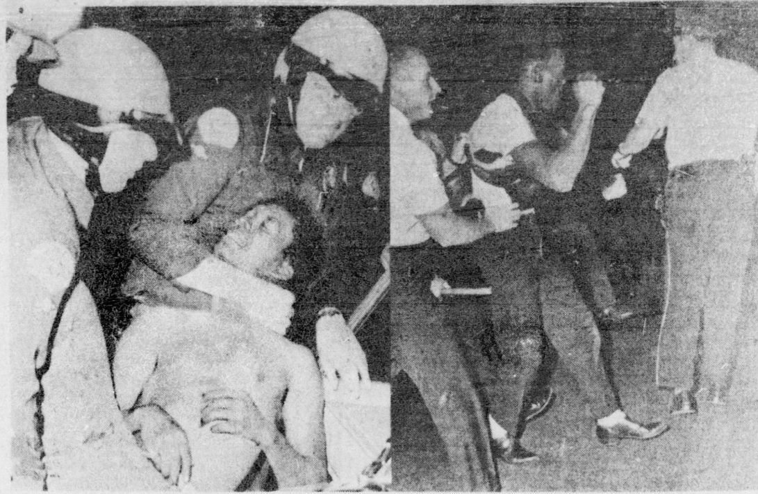
VIOLENCE IN THE STREETS OF TWO OF AMERICA'S LARGEST CITIES - Photo on the top left was taken in Los Angeles, California late Thursday night as policemen force a rioter into a police car during the second night of rioting and looting there. Thirty-three persons have been killed and thousands injured in the city. Top right photo shows a young fist-waving demonstrator being hustled toward a paddy wagon in Chicago late Friday night as a detective shoves him from behind. Chicago rioting was touched off after a young Negro woman was killed by a fire truck accident. In Los Angeles, the holocaust was triggered when white policemen arrested a Negro man suspicion of drunken driving and reportedly kicked him.