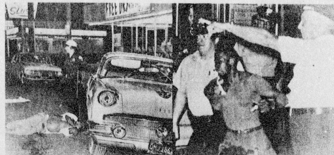
MORE TALES OF TWO CITIES - In the left picture, a policeman stands guard over a damaged car and one of its occupants, lying injured in the street, in handcuffs. National Guardsmen were dispersed across this street in the Watts area of the city when this car, without lights, struck a parked car, which then struck one of the Guardsmen. Note bullet hole in right windshield of car. Right photo shows a young demonstrator in Chicago being led toward a patrol wagon Friday by the cops during the second straight night of "Windy City" riots.