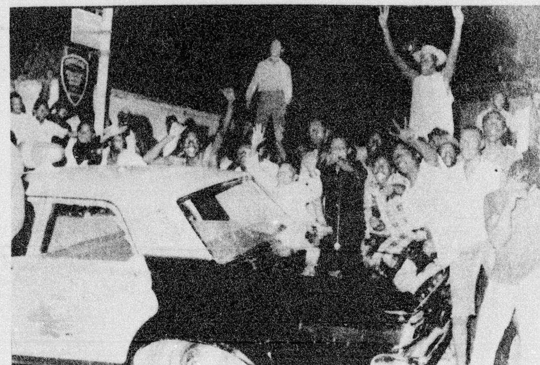
SCREAMING MOB JEERS CALIFORNIA POLICE - Los Angeles: Hundreds of yelling screaming rioters are shown last Thursday night jeering police here as some of their number make ready to mount a police squad car that had been damaged in a riot. The city's worst disturbance in its history was wound up with 34 persons dead, hundreds wounded, and thousands of Negroes arrested and held under heavy bonds.