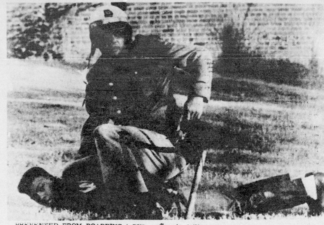
PREVENTED FROM BOARDING A BUS - A Crawfordville, Ga. boy is prevented from boarding a school bus last week by a state highway patrolman as he sits on the ground. About ten Negroes made a dash for the bus, but were rounded up. None were arrested.