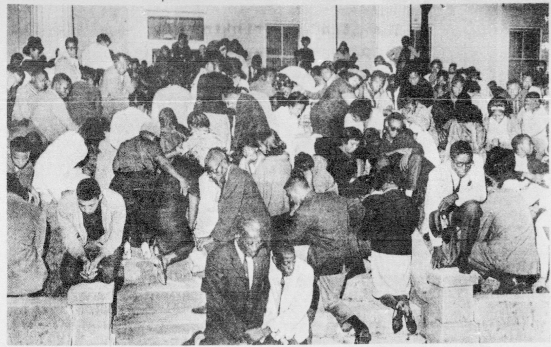
PRAYING IN NATCHEZ--Negro civil rights demonstrators kneel in prayer on the steps of the county courthouse in Natchez, Miss., last week after more than 1,000 marched through the downtown streets in a protest demonstration. They marched under the protection of a federal court injunction, and there were no incidents or arrests. (UPI PHOTO).