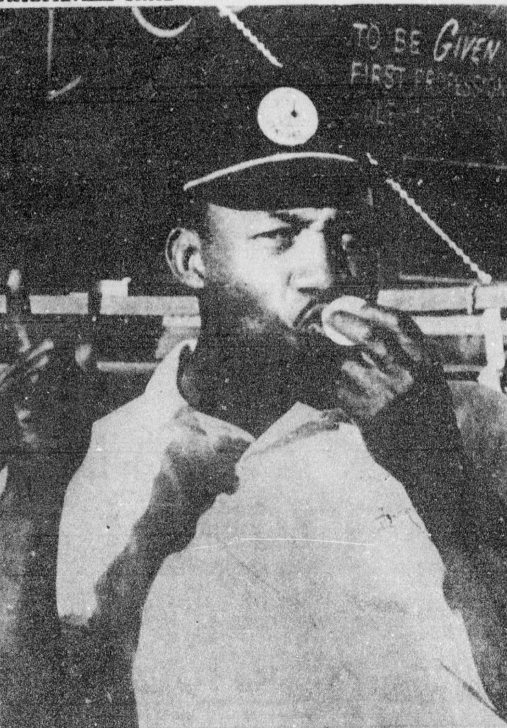
KISSING HIS LUCKY BALL - San Diego, Calif. Charlie Sifford kisses the hole-in-one ball that won him a new car recently. He holed out on the 18th hole at Stardust County Club, and was presented the keys to a new Oldsmobile. The 18th hole is a par 3 190-yarder, and this was Sifford's first hole-in-one in tournament play.