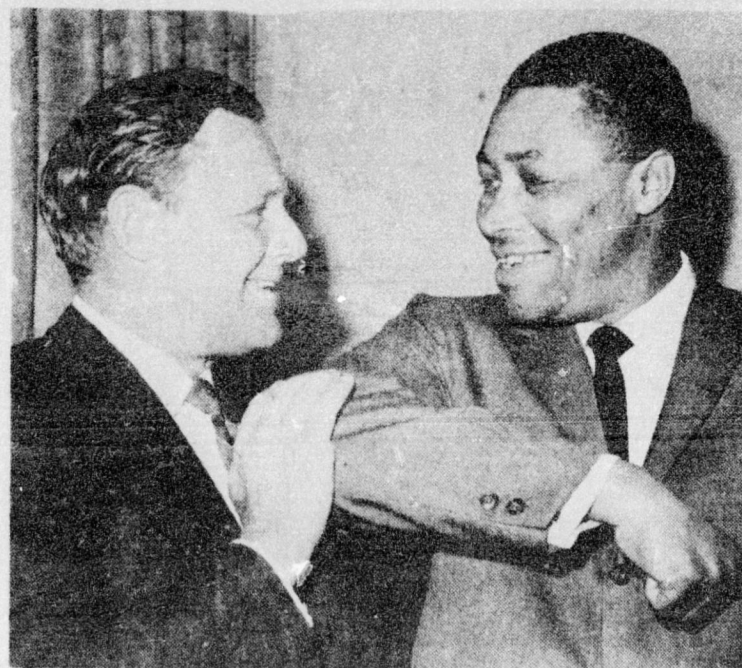
CHECK UP - New York: New York Yankee General Manager Ralph Houk examines catcher Elston Howard's arm here, January 19. Howard, whose injured right elbow marked the beginning of the end for the Yankees in the 1965 American League pennant race, signed his 12th contract with the club, condition as excellent.