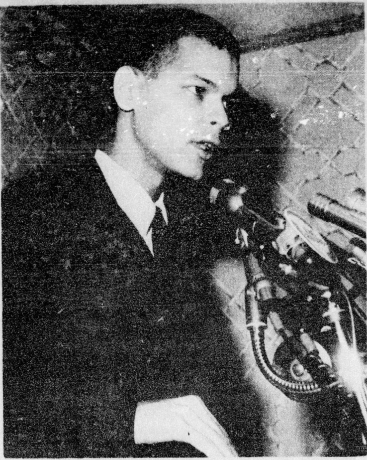
JULIAN BOND IN NEW YORK - New York: Julian Bond who was denied a seat in the Georgia State Legislature because of his pacifist views even though he had been duly elected, holds a news conference here at the Hotel Drake Jan. 20.

RESEARCH IN PRISONS The U. S. sponsors medical research in about half of its 37 penitentiaries, involving over 3,000 men a year.