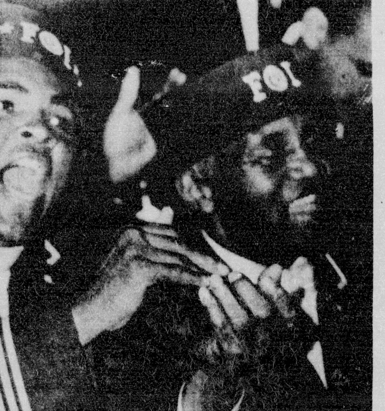
ENTHUSIASTIC BLACK MUSLIM - Chicago: Heavyweight boxing champion Cassius (Muhammad Ali) Clay, clad in the uniform in the Fruit of Islam elite guard of the Negro supremacist cult, applauds loudly as Elijah Muhammad, Black Muslim leader, spoke here recently. Clay was heard saying, "yes sir," many times during the 3 hours in which the cult leader spoke.