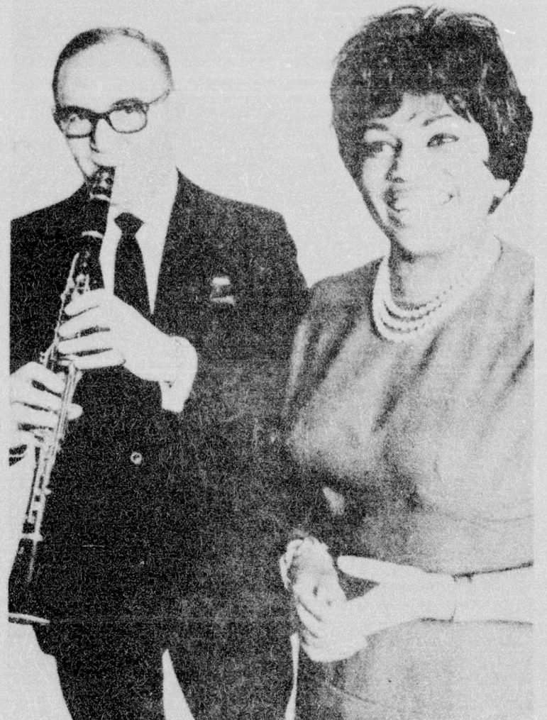
ON BELL TELEPHONE HOUR - Benny Goodman, jazz musician, and Leontyne Price, Metropolitan opera star, will lend their talents to the Bell Telephone Hour, in a special program on music and art masterpieces, Sunday, March 27 at 5:30 p. m. over Columbia Broadcasting System television network.

AS THE WIND put its shoulder to the door, fire smacked its lips as it curled among the embers.