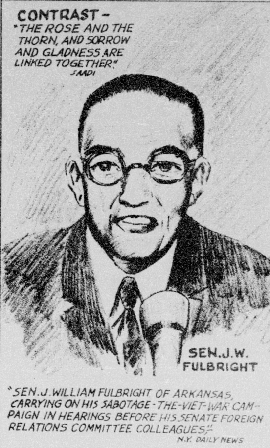
SEN. J.W. FULBRIGHT SEN. J. WILLIAM FULBRIGHT OF ARKANSAS, CARRYING ON HIS SABOTAGE-THE VIET WAR CAMPAIGN IN HEARINGS BEFORE HIS SENATE FOREIGN RELATIONS COMMITTEE COLLEAGUES. N.Y. DAILY NEWS