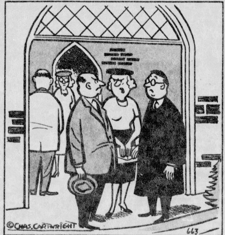
"I think his spirit would like to attend church every single Sunday; but it sometimes has trouble moving 180 pounds of flab!"