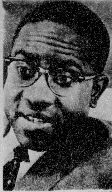
DR. ANDREW F. BRIMMER