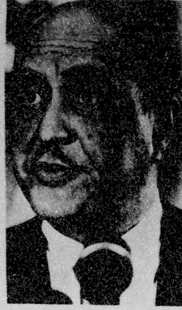
DR. ROBERT C. WEAVER