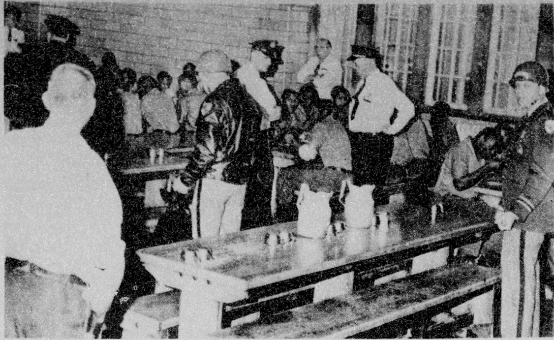
GUARD INMATES AFTER RIOTS - Hagerstown, Md.: Maryland Correctional Institute guards watch over prisoners in the mess hall after riots broke out twice early April 12th. Two inmates were shot and wounded and two others were injured before order was restored. Two state troopers and four guards were also injured. The inmates complained of living conditions in the prison, which was originally built for 150 prisoners but now houses 1,531. (UPI PHOTO).