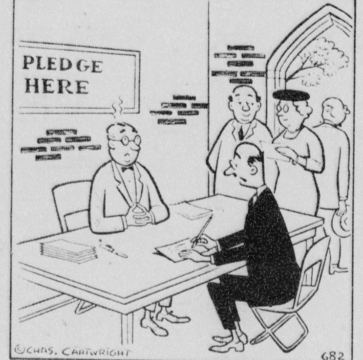
"It looks a little frightening when you lump fifty cents a week into a whole year!"