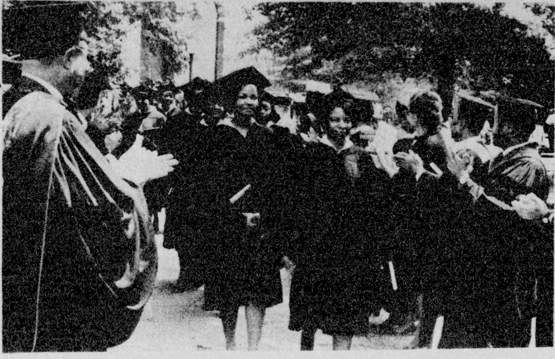
BENNETT COMMENCEMENT - Faculty members applaud graduates as they leave Pfeiffer Chapel after receiving their degrees at Bennett College on Monday. There were 119 in the class -- largest in college's history.