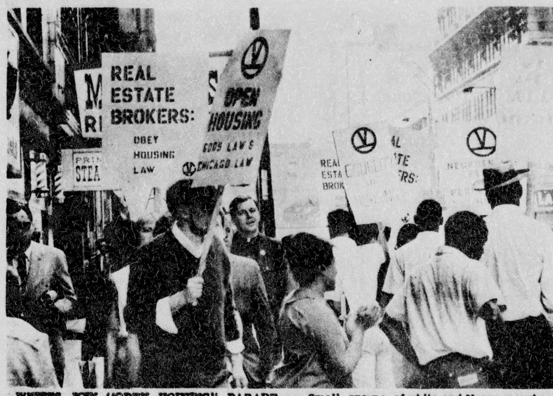
WHITES JOIN "OPEN HOUSING" PARADE -- Small groups of white and Negro marchers demonstrated last week in the "windy City." calling for "open occupancy." The groups also picketed City Hall, the Public Aid Department and several other public buildings in the downtown area. This group is shown at the Chicago Real Estate Board building. Later, the combined groups gathered in an all-white area of Chicago for more deomonstrations.