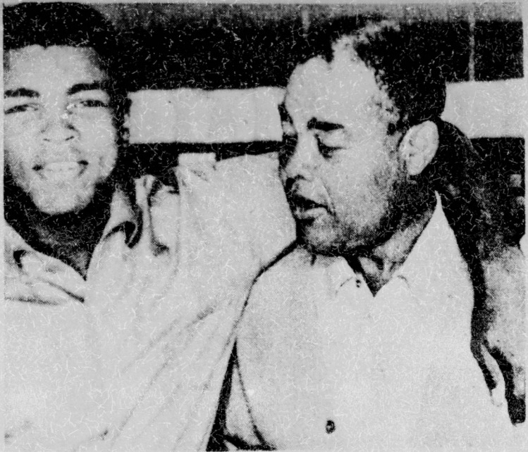
CHAMPS MEET - Frankfurt: Heavyweight Champion Cassius Clay throws his arm around the former heavyweight champ, Joe Louis, as they leave a hotel here Sept. 3. The pair met when Louis checked in after arriving here to watch Clay meet German champ Karl Mildenberger in a title bout Sept. 10th.