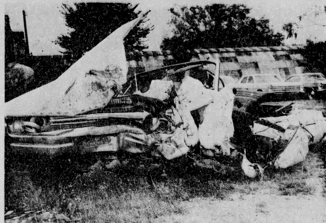
DEATH CAR FOR FIVE IN COUNTY - Pictured above is the late model convertible in which four Negroes were reportedly being driven to work last Sunday by a white tobaccoist, bondsman, businessman, near Fuquay-Varina. (See story).