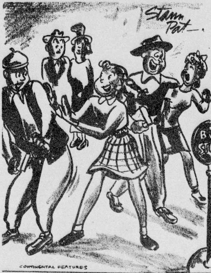
Have Fun... But Don't Clown.