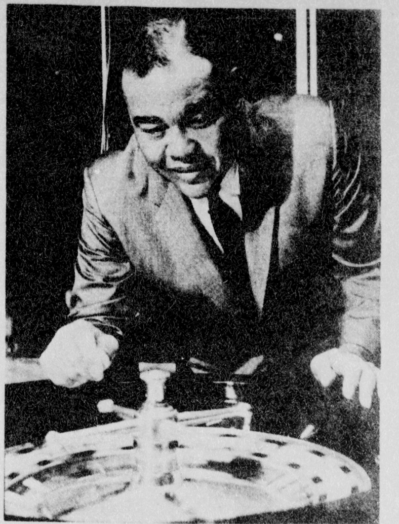
HOST - Former world heavyweight boxing champ Joe Louis takes a spin at the roulette wheel at the Pigalle Sporting Club in London's West End. Joe is a host at the club and for seven nights a week greets members as they arrive. The former champ will also see that things run smoothly at the club.