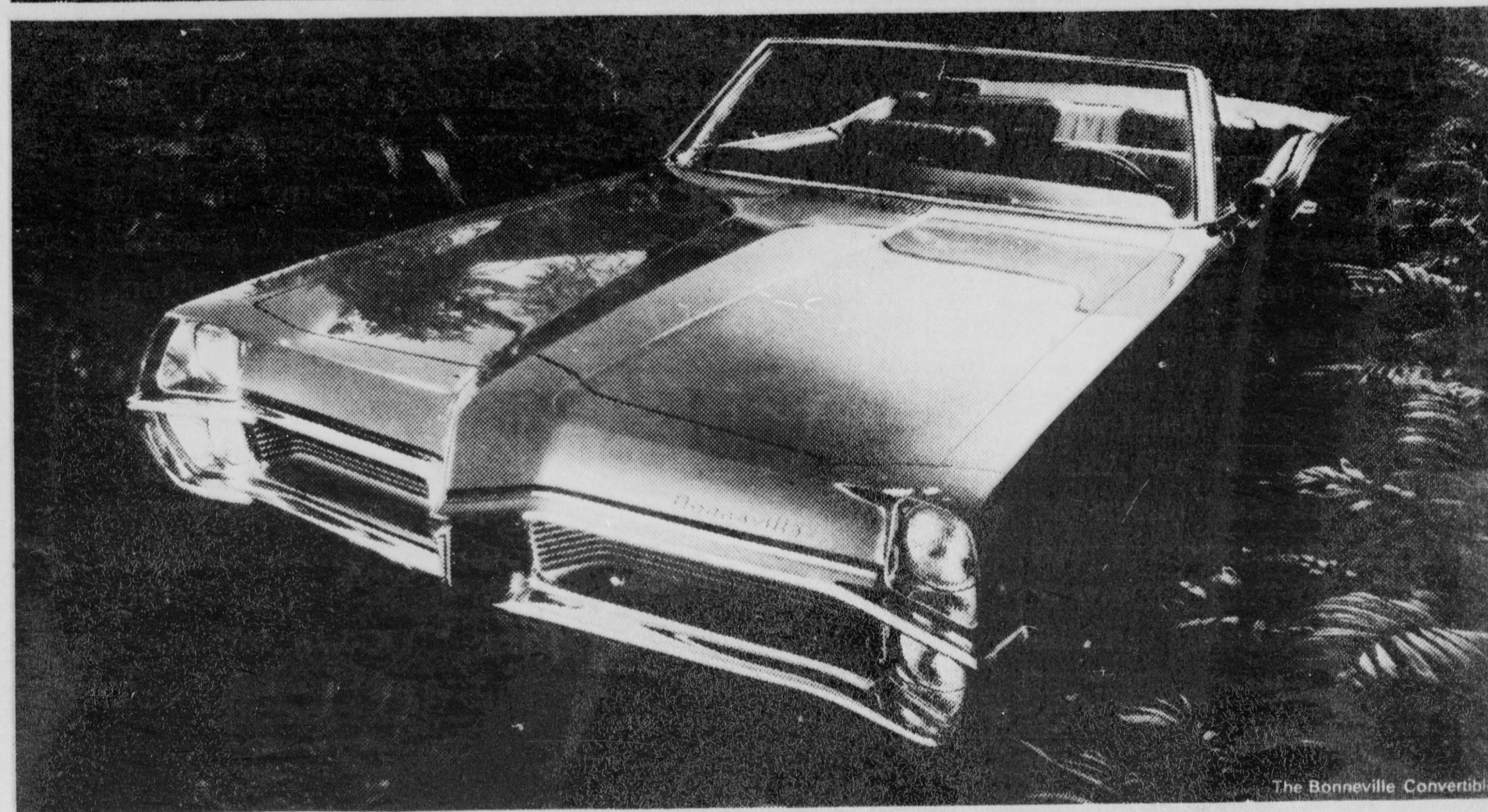
The Bonneville Convertible

The Wide-Track Winning Streak starts at your authorized Pontiac dealer's.