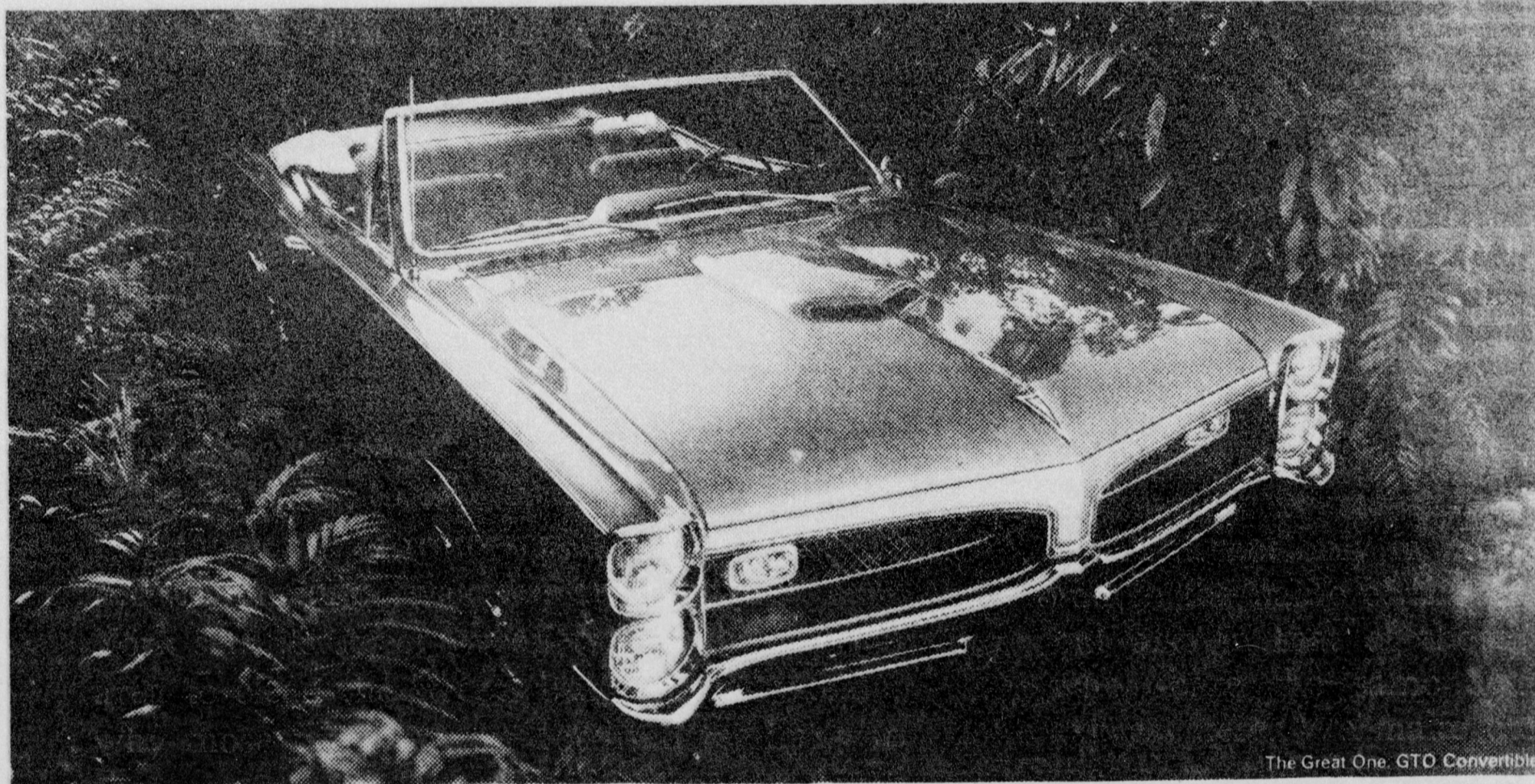
The Great One: GTO Convertible