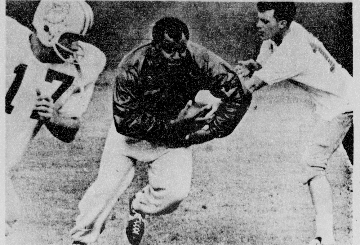
FIRST WORKOUT - Miami, Fla.: Former Denver Broncos' fullback Cookie Gilchrist (center), who recently signed with the Miami Dolphins, carries the ball during his first workout. Dolphins' quarterback George Wilson, Jr., is at right. Player on left is unidentified.

Shaw's record now is 0-4-1, with their next game, Saturday, Oct. 29, against the "Eagles" of North Carolina College. Game time is 2 p. m. at Chavis Park, Raleigh, N. C.