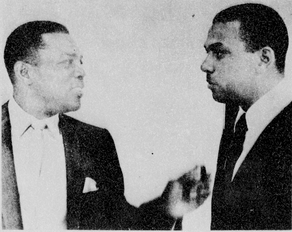
CEPEDA SUES LOOK MAGAZINE - San Francisco, Calif.: Orlando Cepeda (right), the National League's "Comeback Player of the Year," talks with Willie Mays prior to appearing in U. S. District Court here Oct. 18. Cepeda charges that he was libeled in a story in Look Magazine in 1963, and is suing for a million dollars.