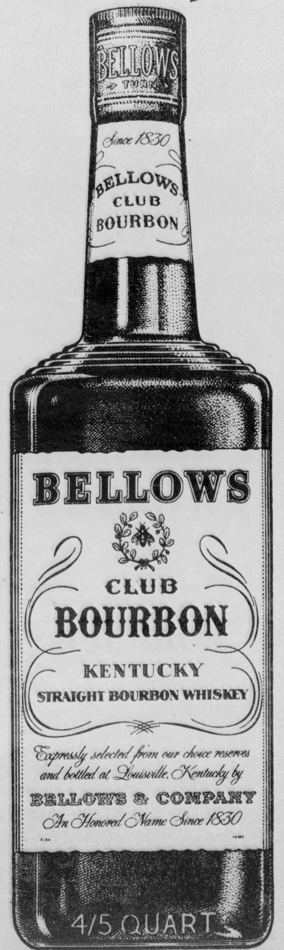
BELLOWS & CO., LOUISVILLE, KY. KENTUCKY STRAIGHT BOURBON WHISKEY • 86 PROOF

Kentucky Straight Bourbon $2.55 PINT $4.10 4/5 QT.