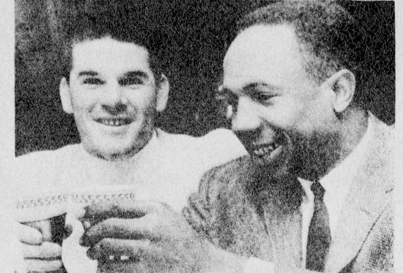
ROBINSON VISITS OLD FRIENDS, EX-TEAMMATES - Cincinnati: Frankie Robinson, right, star of the recent Baltimore-Los Angeles World Series clash, is in town visiting with friends and former teammates when he was with the Reds. Here he drinks a Coke toast for old-time-sake with Pete Rose, Reds' second baseman.

The defeat left the Bears with a 0-3-1 record for the season, with their game, Saturday, October 22nd, at Johnson C. Smith University in Charlotte, North Carolina.