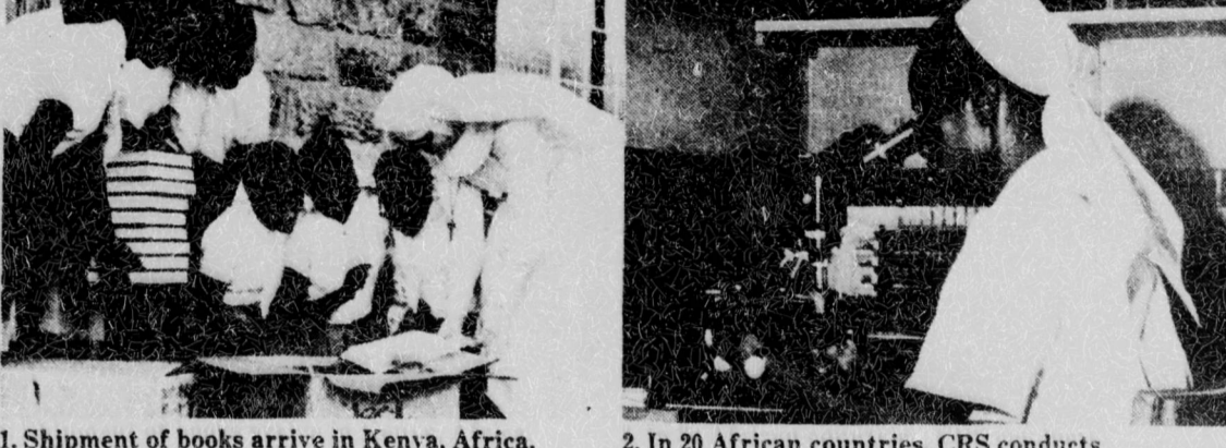
1. Shipment of books arrive in Kenya, Africa.