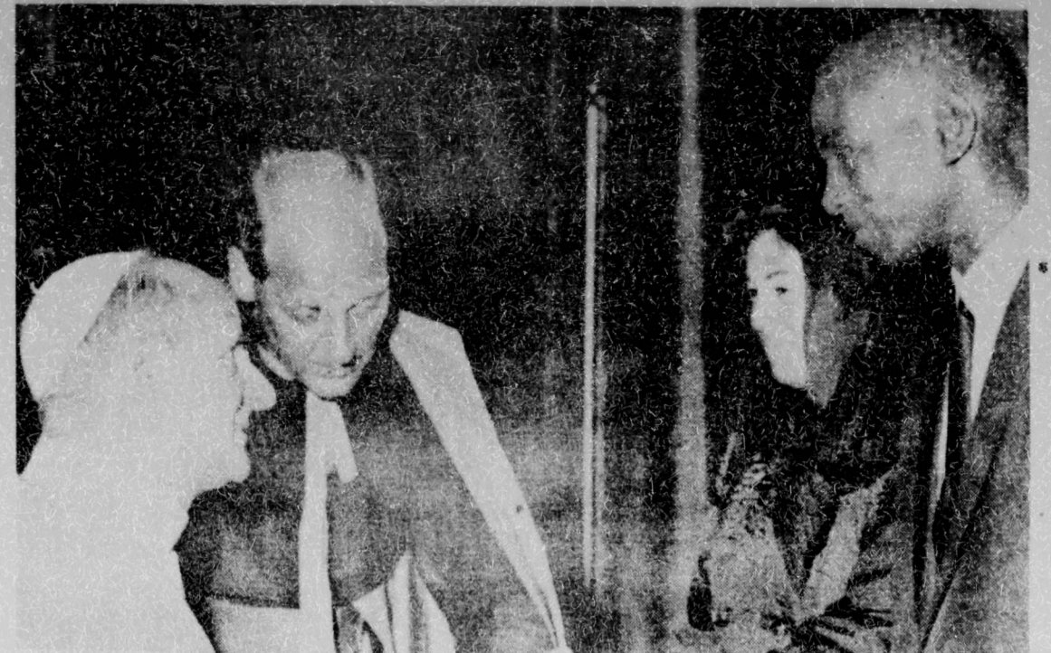
PONTIFF RECEIVES BASEBALL STAR - Vatican City: Pope Paul VI receives Chicago Cubs infielder Ernie Banks and his wife in a special audience here Oct. 26th. Standing by is a Vatican official.