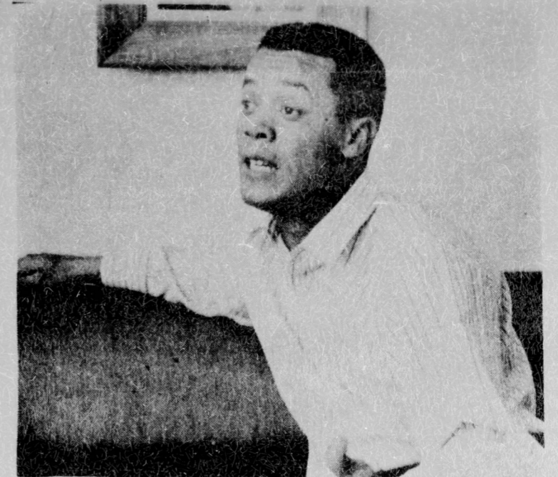
INTERVIEWED ON THE COUNT - Seattle, Wash.: Los Angeles Dodgers star Maury Wills, interviewed in his hotel room here Nov. 29, while he awaits the start of his tax hearing, Nov. 30. Wills said, about his possible trade, that if he felt that he'd rather not go with another club, he'd retire. He would rather continue playing he said. Wills has been traded to the Pittsburgh Pirates.