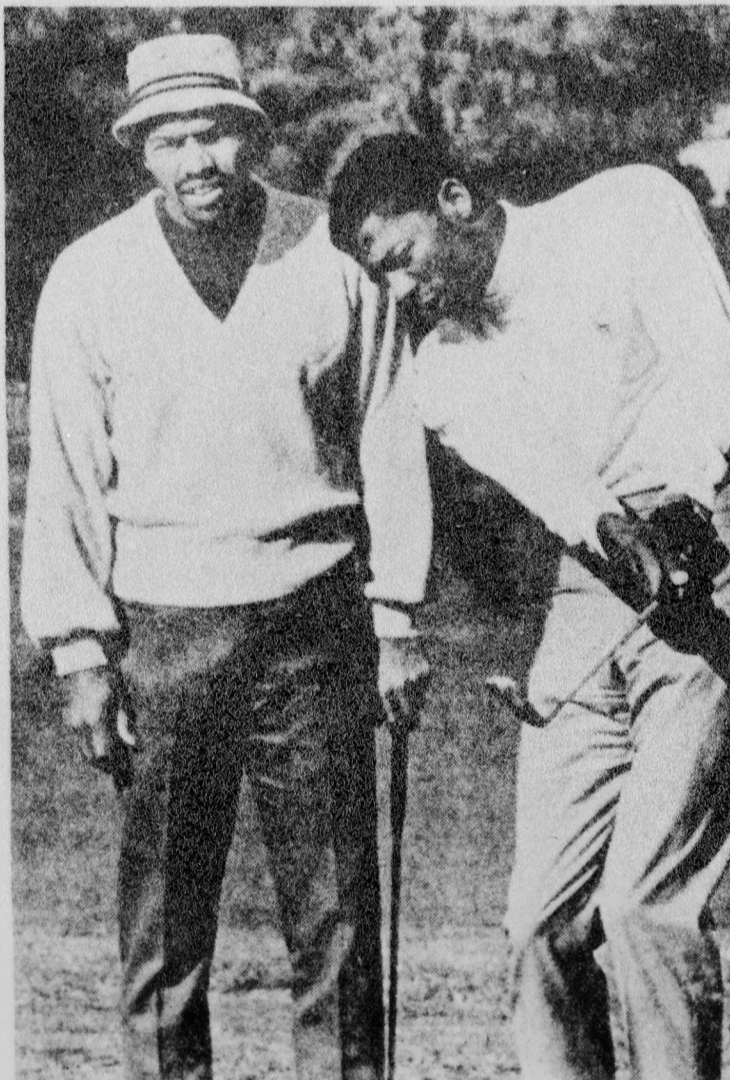
THEY PLAY GOLF ALSO--Call: The Davis boys, Tommy (l) recently traded to the New York Mets and Willie (r), still a Dodger, get together at the 21st Annual Montebello Open Golf Tourney Dec. 8. Willie practices a chip shot as Tommy watches his style. More than a score of baseball's biggest names will join professional golfers in the three day tourney.

*** Early diagnosis and treatment of birth defects can often spare a child a lifetime of physical or mental disability.