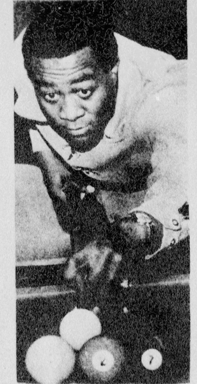
RELAXES WITH POOL - Cleveland, O.: Leroy Kelly of the Cleveland Browns, leading ground gainer in the NFL, shoots pool for a little relaxation. Kelly has 1,127 yards this season with one game left to play. Kelly's nearest rival, Gale Sayers of Chicago Bears, has 1,034.

NCC's next home game will be Jan. 7, against Virginia Union University.