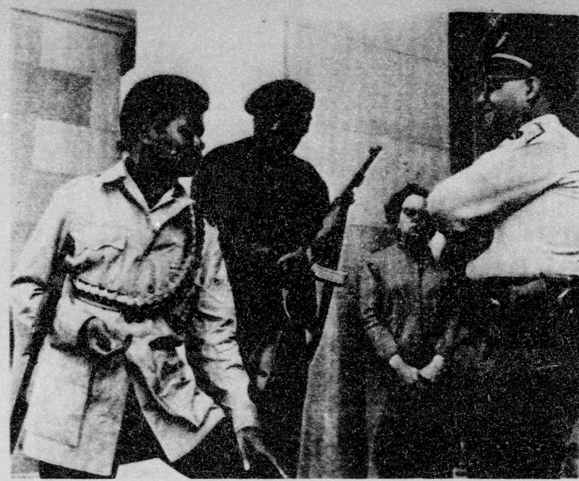
WEAPONS OR TROUBLE BANNED - Sacramento, Calif.: 2 members of the Black Panther Party are met on the State Capitol steps by State Police Lt. Ernest Holloway, who informed them that they would be allowed to keep their weapons as long as they caused no trouble or did not try to disturb the peace. Earlier several members of the society invaded the Assembly chambers and had their guns confiscated.