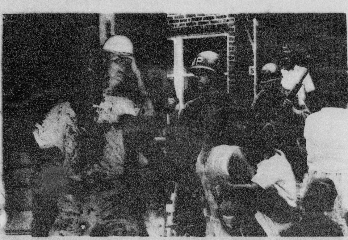
NEWARK RIOTING - Newark, N. J.: A Newark policeman leads a bleeding man from a building here early July 14th during a continuation of rioting that has rocked this city. National Guardsmen and state police have been called out to aid local police. (UPI PHOTO).