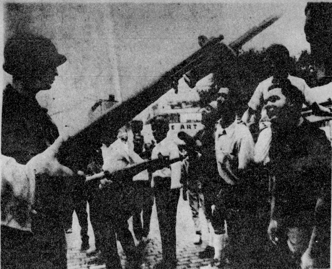
JEER AT GUARDSMEN - Negroes jeer at bayonet-wielding National Guardsmen here July 14th. The National Guard and New Jersey state police were called out July 14th to aid Newark police, following the second night of disorder in this, New Jersey's largest city.

Temperatures during the period Thursday through Monday will average below normal. Daytime highs are expected to average around 80 in the mountains and along the outer banks, and in the middle and upper 80s elsewhere. Lows at night will average around 60 in the mountains and the mid and upper 60s elsewhere, turning cooler over most sections over the weekend and little change thereafter. Precipitation will total 1-4 to 3-4 of an inch, occurring as scattered showers or thunder showers, almost daily, mainly in the afternoon and evening.