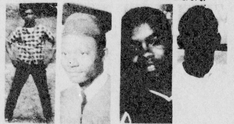
STREET HARRIS BURTON THOMAS