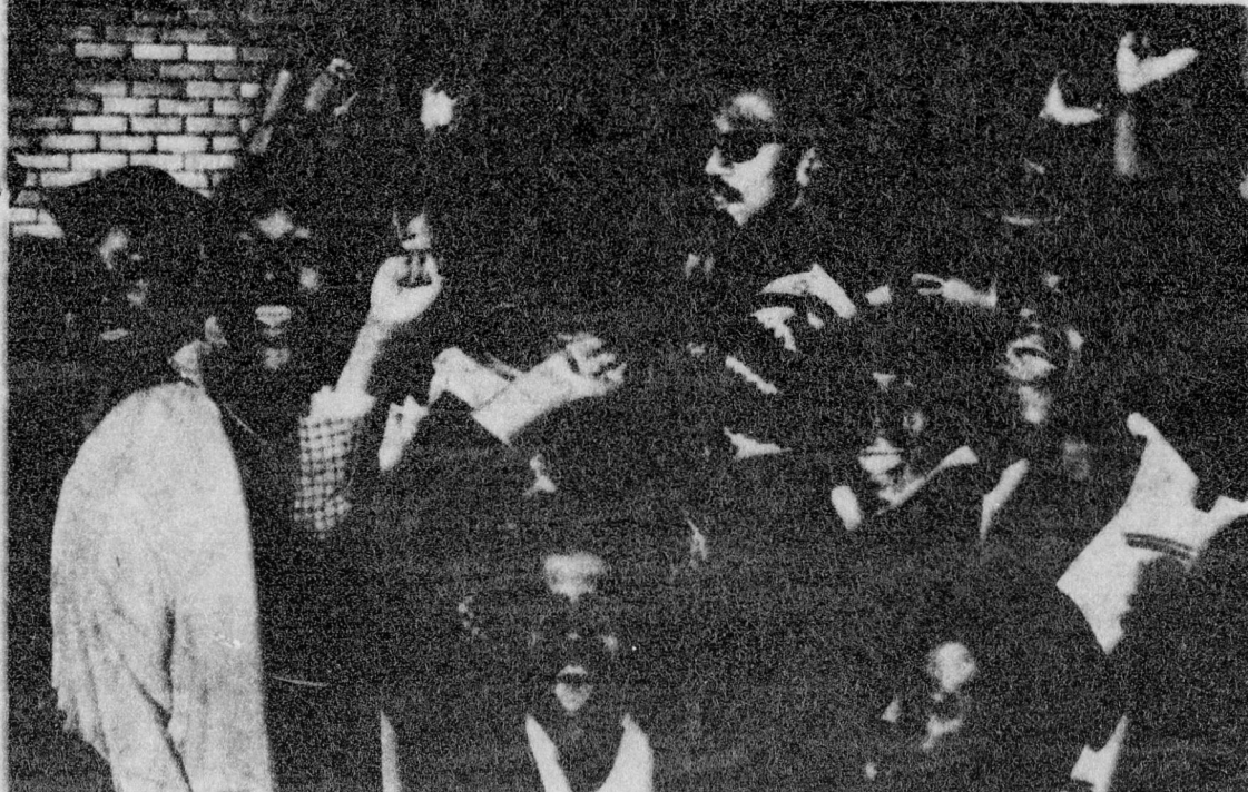
STUDENTS CHEER "RAP" - New York: Black Power advocate H. Rap Brown is cheered by children of controversial Intermediate School 201 in Harlem Sept. 12. Brown entered the school saying he was going to teach as a volunteer. The school and all the others in the city have been hit by a teacher walkout since start of the new term Sept. 11.