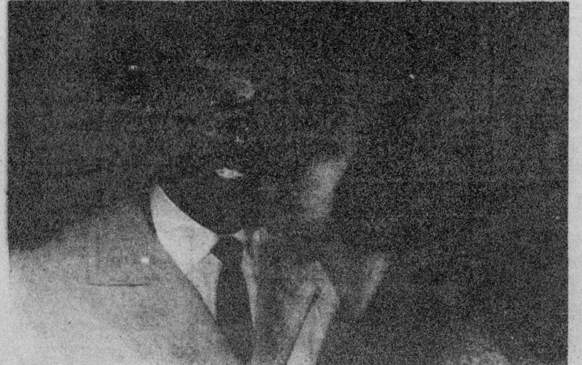
WELL EARNED KISS - St. Louis: Cardinal pitching ace Bob Gibson is kissed by his wife as they arrived back from Boston, Oct. 12, where Gibson won his 3rd World Series game and pitched the Cardinals to World Series championship. Gibson was the big man for the Cardinals who had to go the full 7 games to beat the Boston Red Sox.

HILL'S Inc. 501 NORTH BLVD. Phone 833-4884