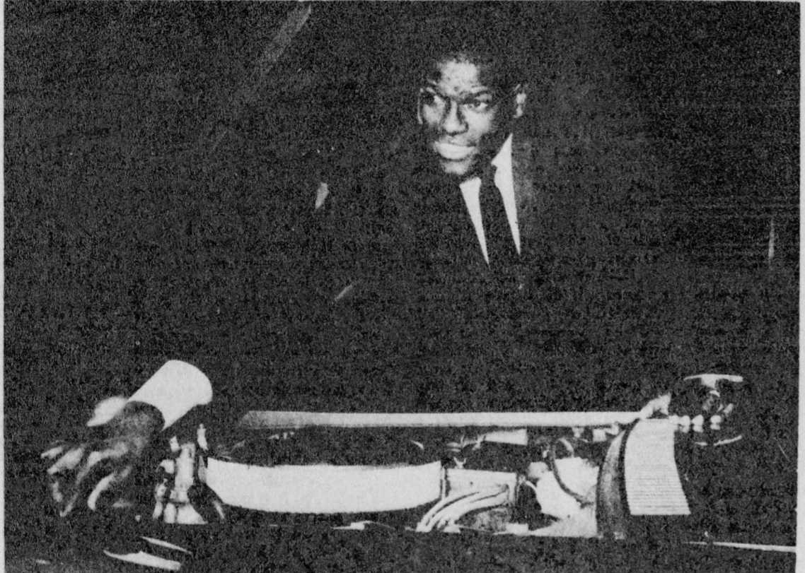
GIBSON GETS WORLD SERIES PLAYER AWARD-New York: St. Louis Cardinals' pitcher Bob Gibson, whose three wins against the Boston Red Sox brought the World's Championship of baseball to St. Louis, looks over the motor of his 1968 Corvette convertible after the car was presented to him in a ceremony here October 16th. The car was Bob's prize for being named winner of the 13th annual "Sport Magazine World Series Award" as outstanding player of the 1967 World Series.