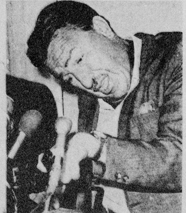
ON SPEAKING TRIP - Los Angeles: Adam Clayton Powell, the Harlem Democrat excluded from Congress by his peers and threatened with arrest if caught in New York, thumps the table and microphones as he makes a point during a news conference after his arrival Jan. 8. Powell was scheduled to make a speech at UCLA Jan. 10 and said he would make a tour of Watts during his stay.