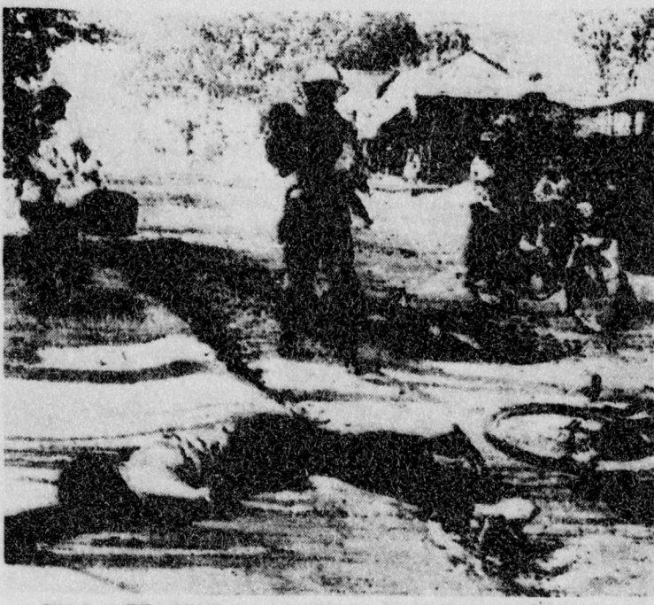
JEEP ATTACKED - Da Nang, S. Vietnam: Vietnamese civilians run past body of man who was killed when jeep (background) carrying government troops was ambushed by Viet Cong terrorists during Communist attacks here Jan. 30. A South Vietnam major and his driver were slain in the ambush of the jeep.