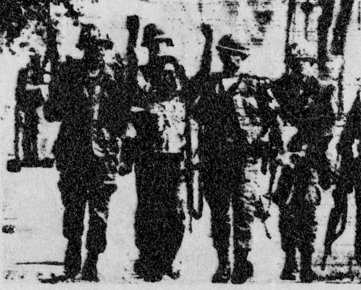
SUSPECT SURRENDERS - Saigon, Vietnam: A Viet Cong suspect, believed to be one of the suicide squad members who stormed the U.S. Embassy and occupied part of it for a short time Jan. 31 (Saigon time), is being taken to a jeep by American Military police during fighting that raged in scattered