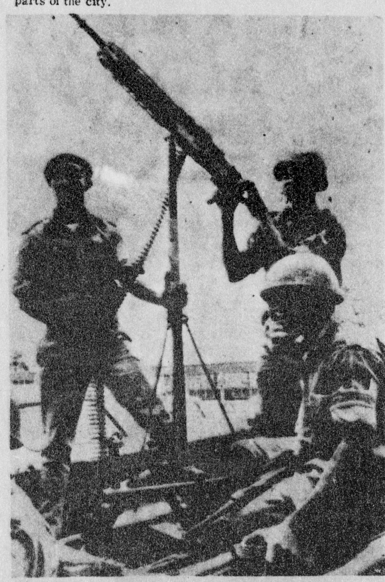
CIVIL WAR IN NIGERIA - Umuahia, Biafria: Biafrian' troops man a Czechoslovakian jeep-mounted machine gun here Jan. 27 to guard against Nigerian air attacks as Biafrian military leader Lt. Col. Odumegwu Ojukwu addresses his consultative assembly in a nearby building. Ujukvu told a UPI correspondent recently that secessionist Biairia would welcome intervention by the United States to end the sixmonth-old civil war between Nigeria and Biaira, the name taken by the eastern region of Nigeria when it seceded last July.