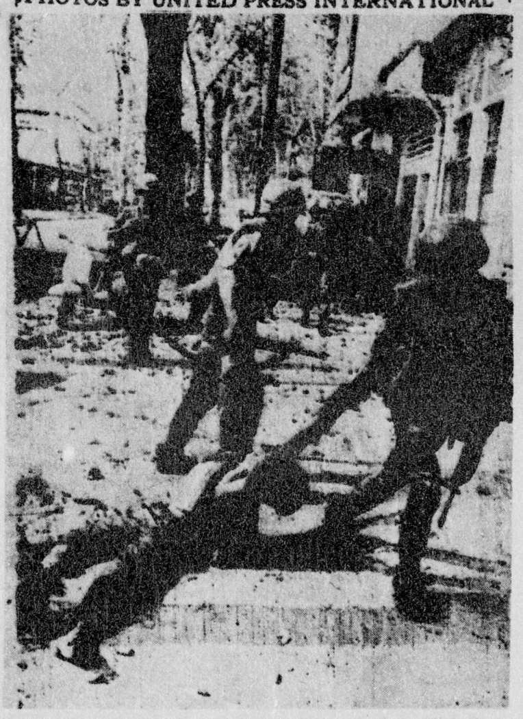
ENEMY REMOVED - Saigon: Body of slain Viet Cong suspect is dragged away from a government billet by two South Vietnamese soldiers, here Jan. 31, during Communist assaults on allied installations,