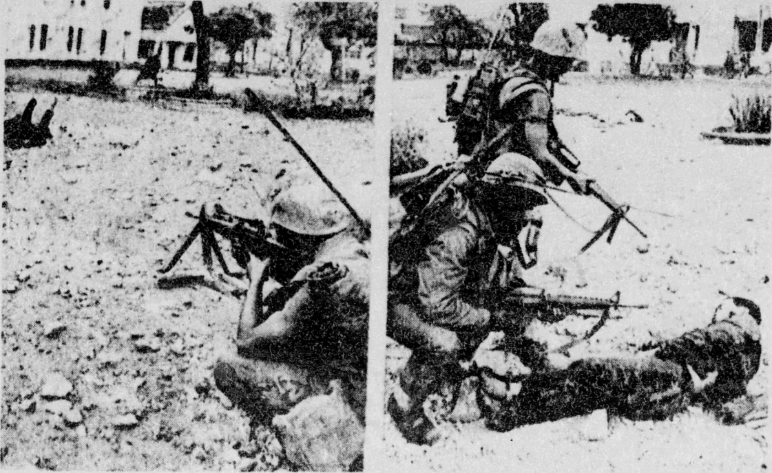
MOWED DOWN - Hue, S. Vietnam: U. S. marine (L) draws an M-16 bead on a wounded enemy soldier who sprawls on the ground and raises his hand to stop the bullets that have been whizzing around him. In the photo at right the same Marine and a comrade (foreground) move in to search and secure their prisoner. This capture occurred during Hue street fighting Feb. 6 near the Provincial Headquarters.