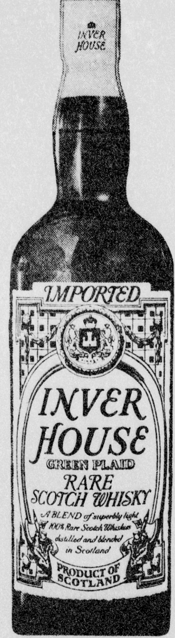
100% BLENDED SCOTCH WHISKY BOTTLED BY IMPORTERS OF INVER HOUSE DISTILLERS, LTD., PHOENIX