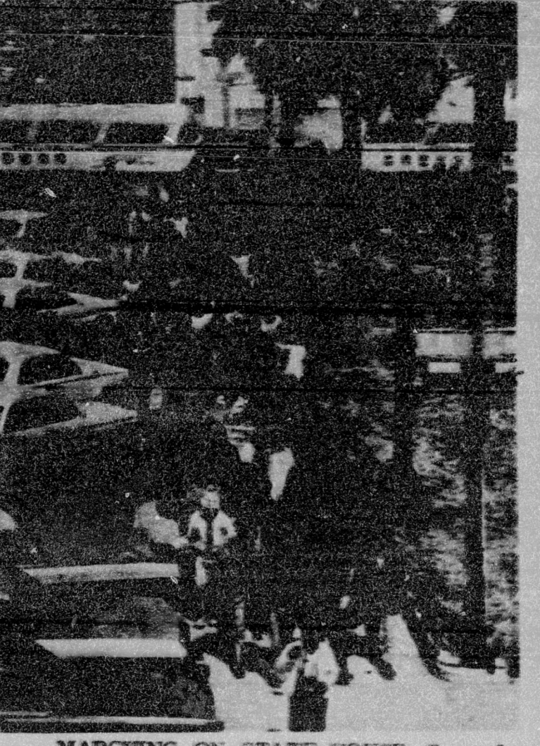
MARCHING ON STATE HOUSE: Several hundred Negro students are shown marching on the South Carolina State House in Columbia March 7 in protest of the slaying of three students at South Carolina State College in Orangeburg. Six students were arrested for disturbing legislators with shouts of protest.