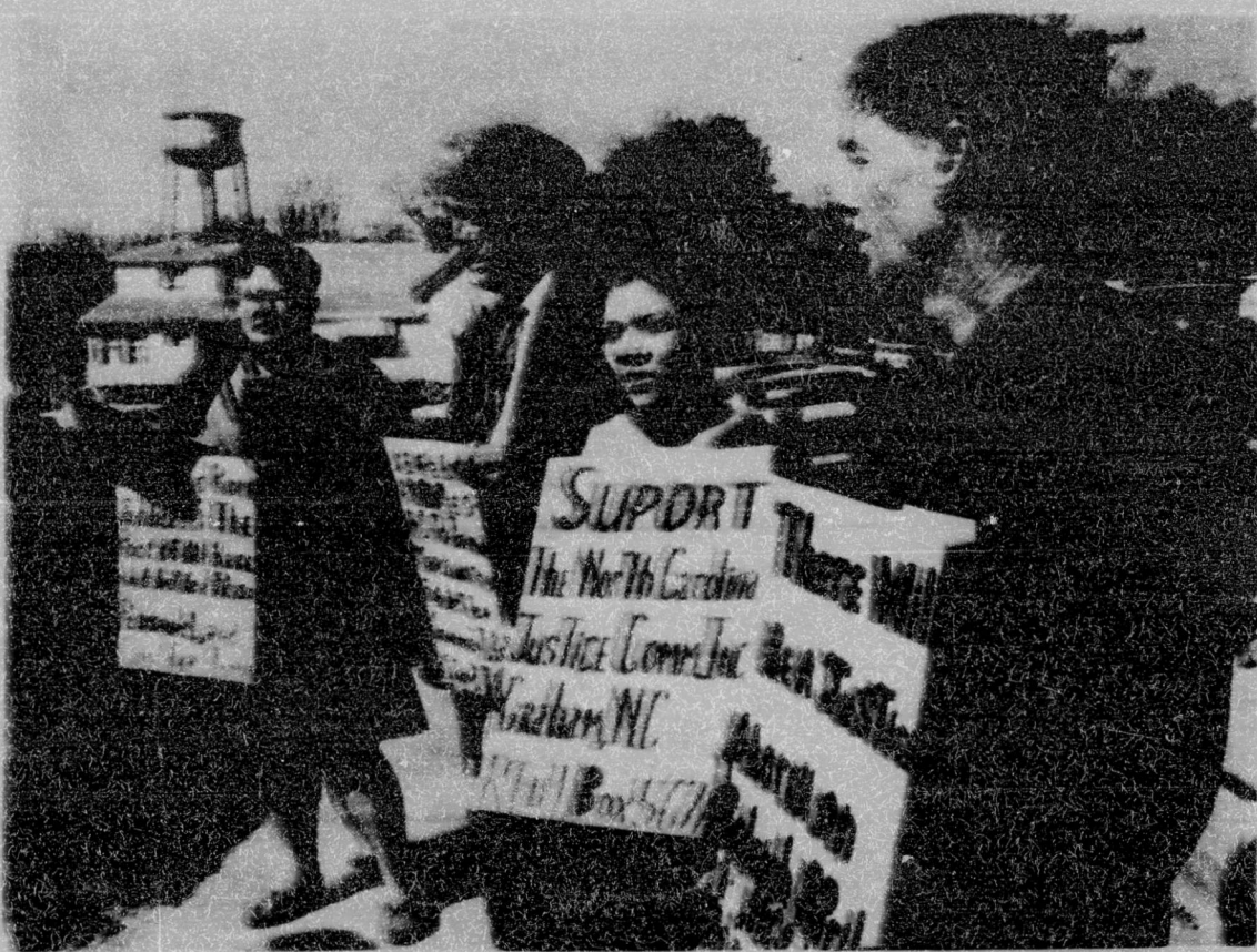
PRISON PICKETTED - RALEIGH: Four pickets marched in front of the Central Prison administration building here this morning March 25, to protest prison conditions and to demand fair treatment for all inmates.

She is alleged to have called relatives who are said to have told her that there were times when he slept continuously. (See SUCCESSORS, P. 2)