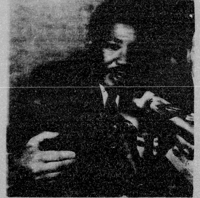
AT ODDS WITH POWELL - NEW YORK: Dr. Martin Luther King talks to the press at Harlem's Canaan Baptist Church March 24. King disagreed with Adam Clayton Powell's call March 24 for "civil war" against the white power structure. He also declined to answer Powell's charges that he and other moderate Negroes had sold out to the whites.

Temperatures during the period Thursday through Monday will average above normal. Daytime highs are expected to average in the upper 60s or lower 70s in N. C. and in the 70s in S. C. Lows at night will average mostly in the 40s in N. C. and in the upper 30s or lower 40s in S. C. Rain through the remainder of this week. Tuesday cooler about Monday. Precipitation will total about 1/2 inch occurring as showers and scattered thunder showers mostly Tuesday and Monday. Windy high and low over the period. 45- and 42.