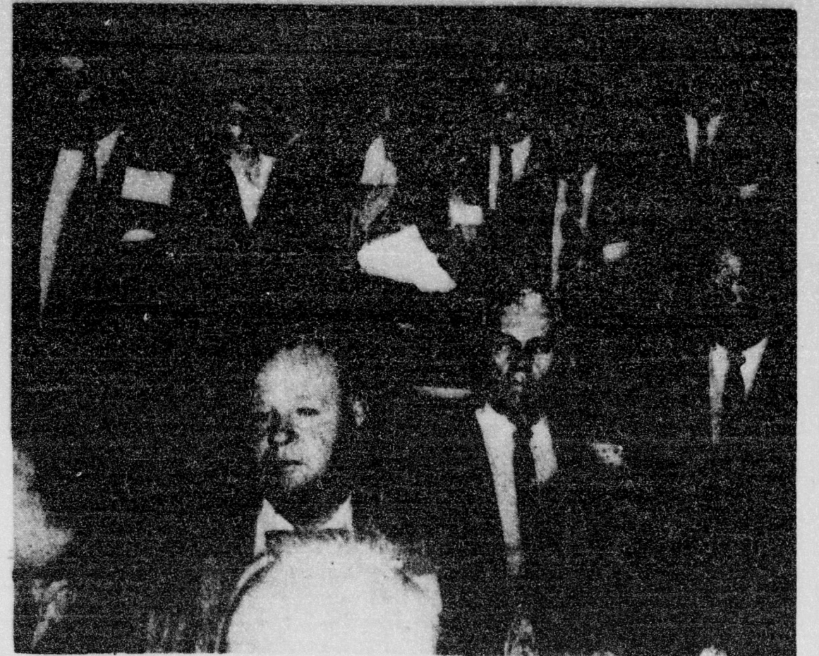
PARTY DISSIDENT - A group of about 100 Negro and white demonstrators, all delegates to the State Democratic Convention now underway here, demonstrated June 6 after their efforts to gain more representation in the national Democratic Convention delegation failed.

Ray was taken into custody at the airport, where he arrived on a flight from Lisbon, Portugal, to Brussels, Belgium. His arrest came when, for some unexplained reason, he left the transit lounge, and was picked up by immigration officials. So far as it has been determined (See CONSPIRACY, P. 2)