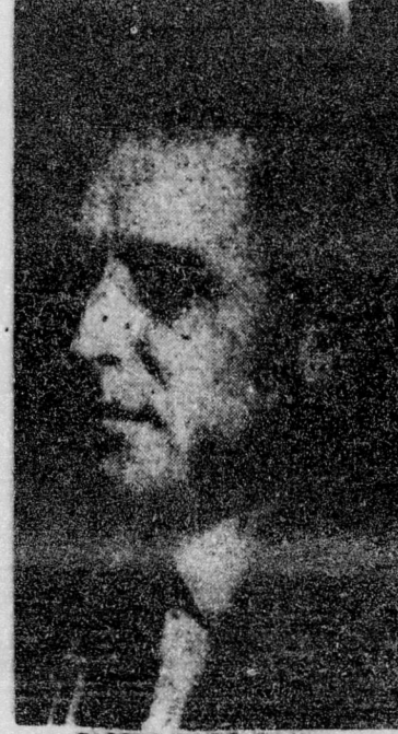
JAMES EARL RAY

Speaking in the Raleigh Memorial Auditorium at 3 p. m., the 103rd Commencement orator declared, "The events of the past few days have placed upon this graduating class an (See MAKE, P. 2)