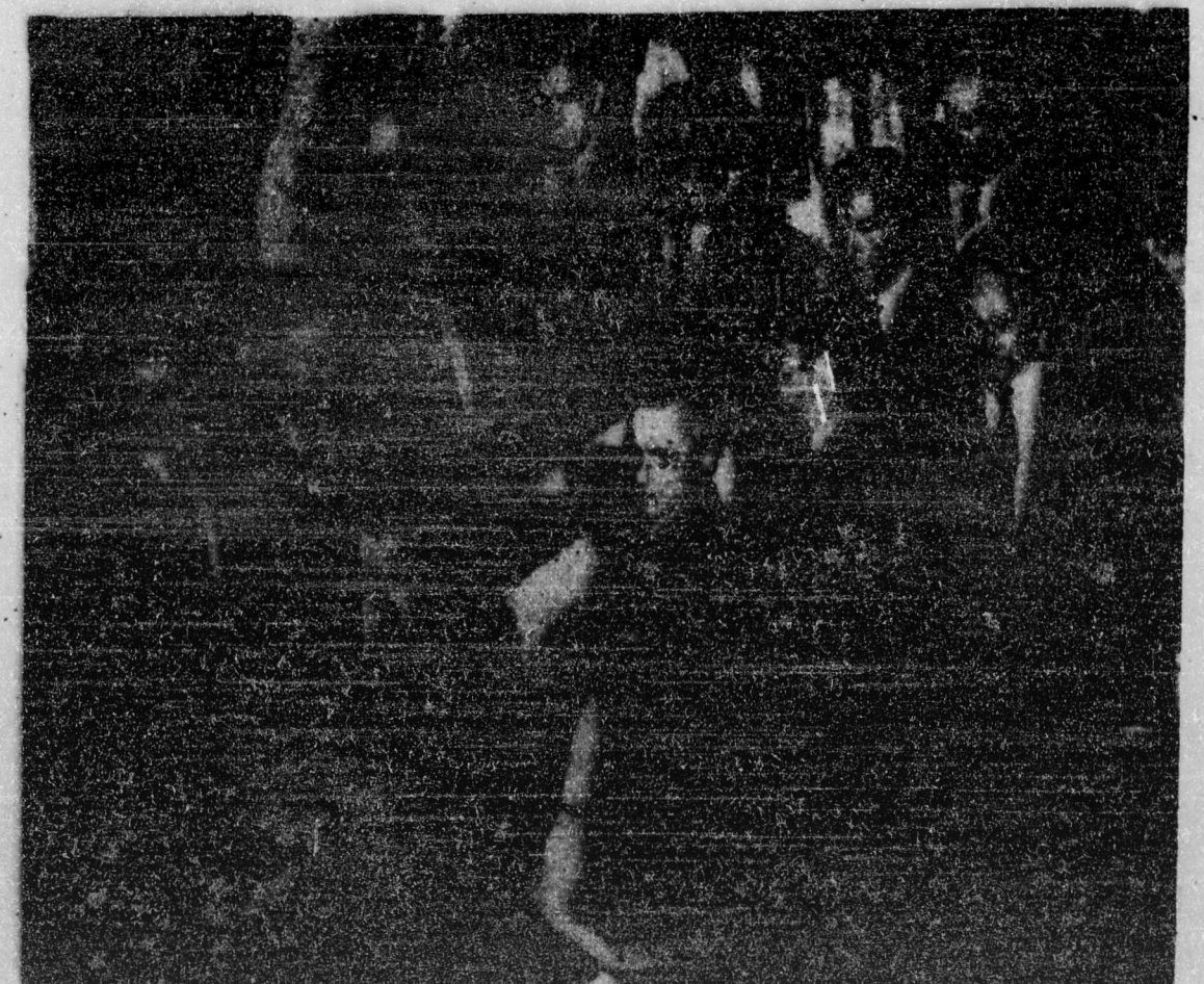
A SON OF FAITH AND COURAGE - Arlington, Va.: Joseph Kennedy III, eldest son of slain Sen. Robert F. Kennedy, leads the pallbearers as they carry the casket to the gravesite at Arlington National Cemetery. Sen. Edward Kennedy is at left.