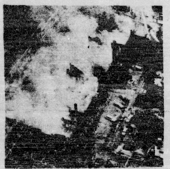
BUILDING GUTTED - Cleveland, O.: Smoke pours from these gutted buildings which were destroyed in a night of rioting in Cleveland's east side district. Ten persons are now known dead, three of the dead were police officers.