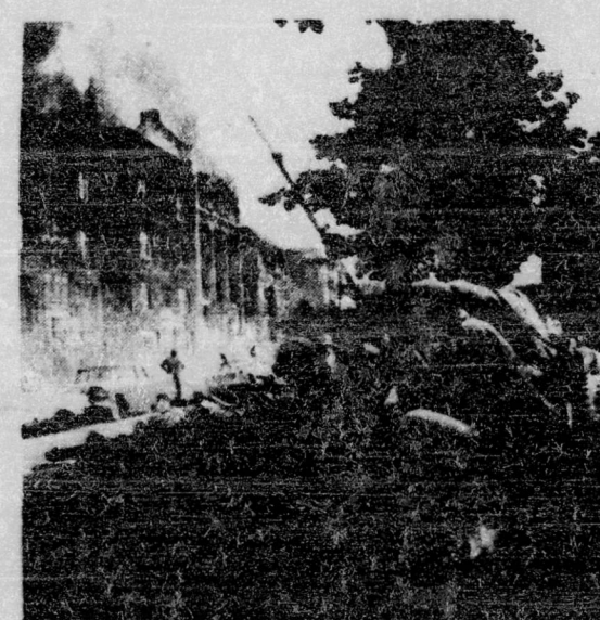
CLEVELAND ON FIRE - Cleveland, O.: Ohio National Guardsmen maintain a guard position on this street while smoke pours out from the Linder Hotel in the background. In a night of rioting nine persons died in Cleveland's east district.