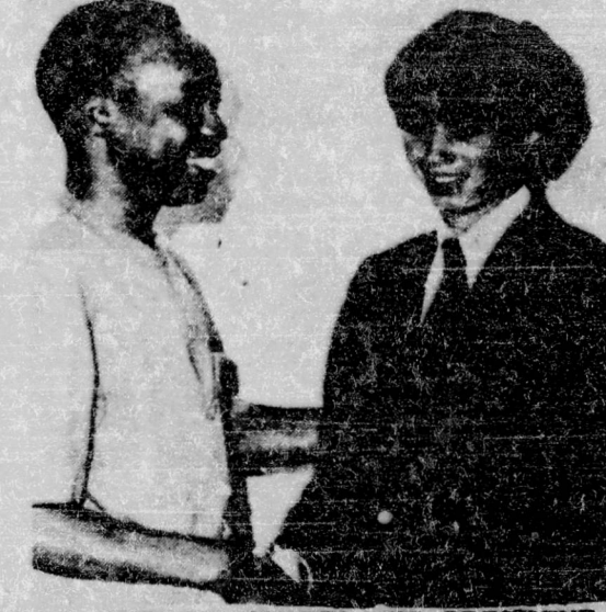
A KENNEDY GREETING THE PRESIDENT - Dar Es Salaam, Tanzania: Tanzanian President Julius K. Nyerere shakes hands with Robert F. Kennedy, Jr., here July 22 during the boy's visit to presidential headquarters. Young Kennedy, son and namesake of the late Senator, is currently staying at a summer camp in Tanzania.

Temperatures during the period Thursday through Monday will average much above normal over eastern North Carolina. Daytime highs will average in the middle 80s in the mountains and 80 to 85 elsewhere. Low temperatures at night during the period will be in the middle 50s in the mountains, 50 to 75 degrees elsewhere inland and 75 to 79 degrees along the coast. It will be warm through the weekend, with a change to cooler temperatures about the beginning of next week. Precipitation will occur as showers and thunderstorms, mainly Sunday and Monday and will average one-half to three-fourths of an inch during the period.