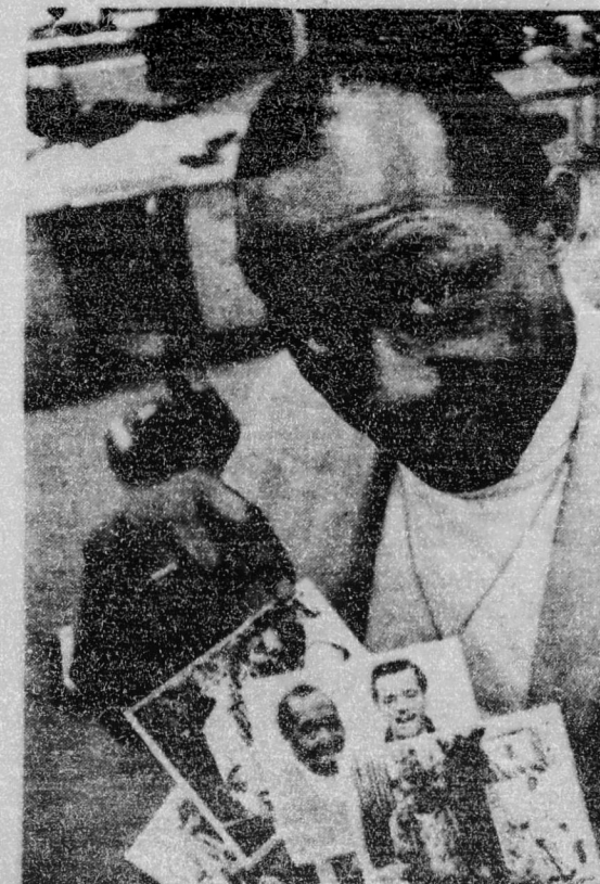
FETCHIT PROTESTS PORTRAYALS - Chicago: Steph Fetchit, comedian and actor show photographs of his Hollywood days July 22. Fetchit has protested the portrayal of his place in Negro history by CBS in its television series, "Black History - Lost, Stolen or Strayed."