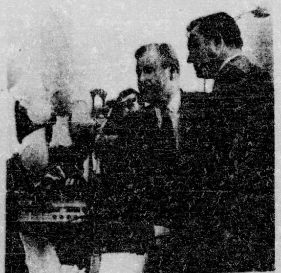
ROCKY IN CHARLOTTE - Charlotte: Presidential candidate Gov. Nelson Rockefeller introduces to the crowd Gov. Kirk of Florida. Gov. Rockefeller was here to meet with the North Carolina delegates.