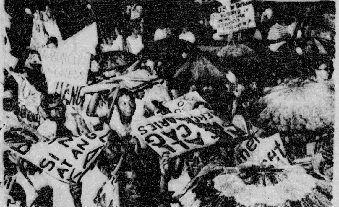
PROTEST VIETNAM WAR - Placards and umbrellas are used as cover from a heavy down-pour during a demonstration at the Philippines Congress to protest the war in Vietnam and demand the recall of Filipino troops from Vietnam July 30. Later, the students stormed into the U. S. Embassy compound but a force of Manila policemen kept them from entering the Embassy building.