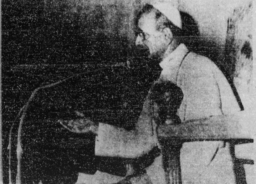
POPE PAUL AGAINST BIRTH CONTROL - Castelgandolfo, Italy: Pope Paul VI, speaking to several thousand pilgrims at his summer residence here July 31, appeals to Christian couples to accept his controversial encyclical on birth control "for its human truth" despite the uproar it has caused in the world.