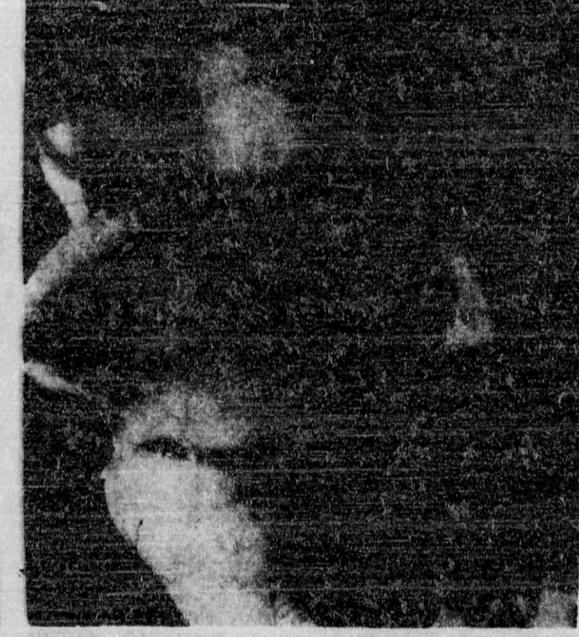
NIGHT OF VIOLENCE - Mexico City: Riot police battle a student demonstrator late July 29 in night of violence which ended with Mexican Army troops using bazookas and bayonets to break up anti-police demonstrators. The students have been calling for the ouster of the police chief.