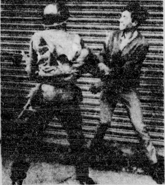
RIFLE BUTT IN STOMACH - Mexico City: Rifle butt is jabbed into student's stomach by paratrooper July 30 as the youth is forced against corrugated metal door. Student is grinning and yelling.