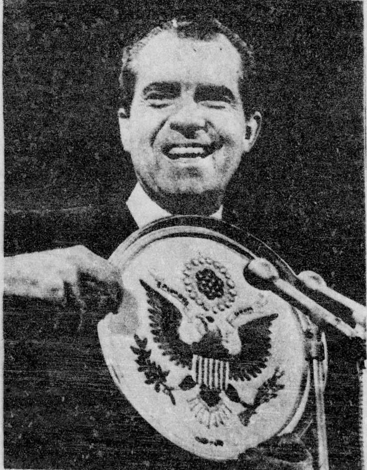
PRESIDENT-ELECT RICHARD M. NIXON

The Negro vote stood firm for Humphrey and Scott throughout the state and it is thought that this vote was the margin by which Bob Scott beat Jim Gardner. Gardner was being eyed by the Negro vote, but when he is alleged to have spurned it, it turned to Scott. In another close race, the Negro seems to have deserted G. Fred Steele for the U. S. Congress seat, from the 4th District, comprising Wake, Durham, Orange, Chatham and Randolph counties. The trend was (See SCOTT WINS, P. 2)