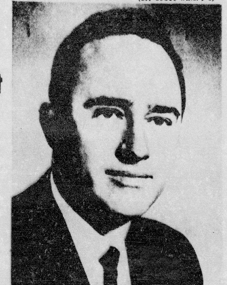
GOVERNOR-ELECT ROBERT W. SCOTT

FIRST CONGRESSWOMAN - New York: Democratic Mrs. Shirley Chisholm, 43, gives a "V" for victory sign after she defeated Civil Rights leader James Farmer here late Nov. 5 to become the first female Negro member of Congress. Mrs. Chisholm, a West Indian-born educator who spent 19 years as a political clubhouse volunteer before getting a chance to become the pioneer Negro State Assemblywoman four years ago, won the newly-reapportioned 12th Congressional District which includes the ghetto neighborhoods of Bedford-Stuyvesant section.