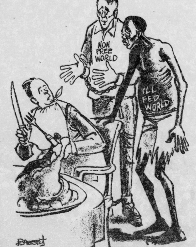
COURTESY SCRIPPS-HOWARD PAPERS - Bassett cartoon for use Nov. 27. (UPI TELEPHOTO).

"YOU MEAN YOU FIND SOMETHING TO BE THANKFUL FOR EVERY YEAR?"