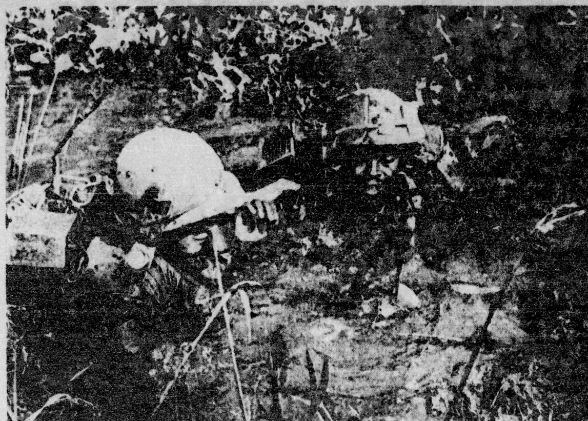
PRICE OF WAR - Ben Loc, South Vietnam: Two members of the 199th Light Infantry Brigade battle a swift current as they cross stream here recently. As the fighting continues, full scale peace talks will begin on January 25 in Paris.