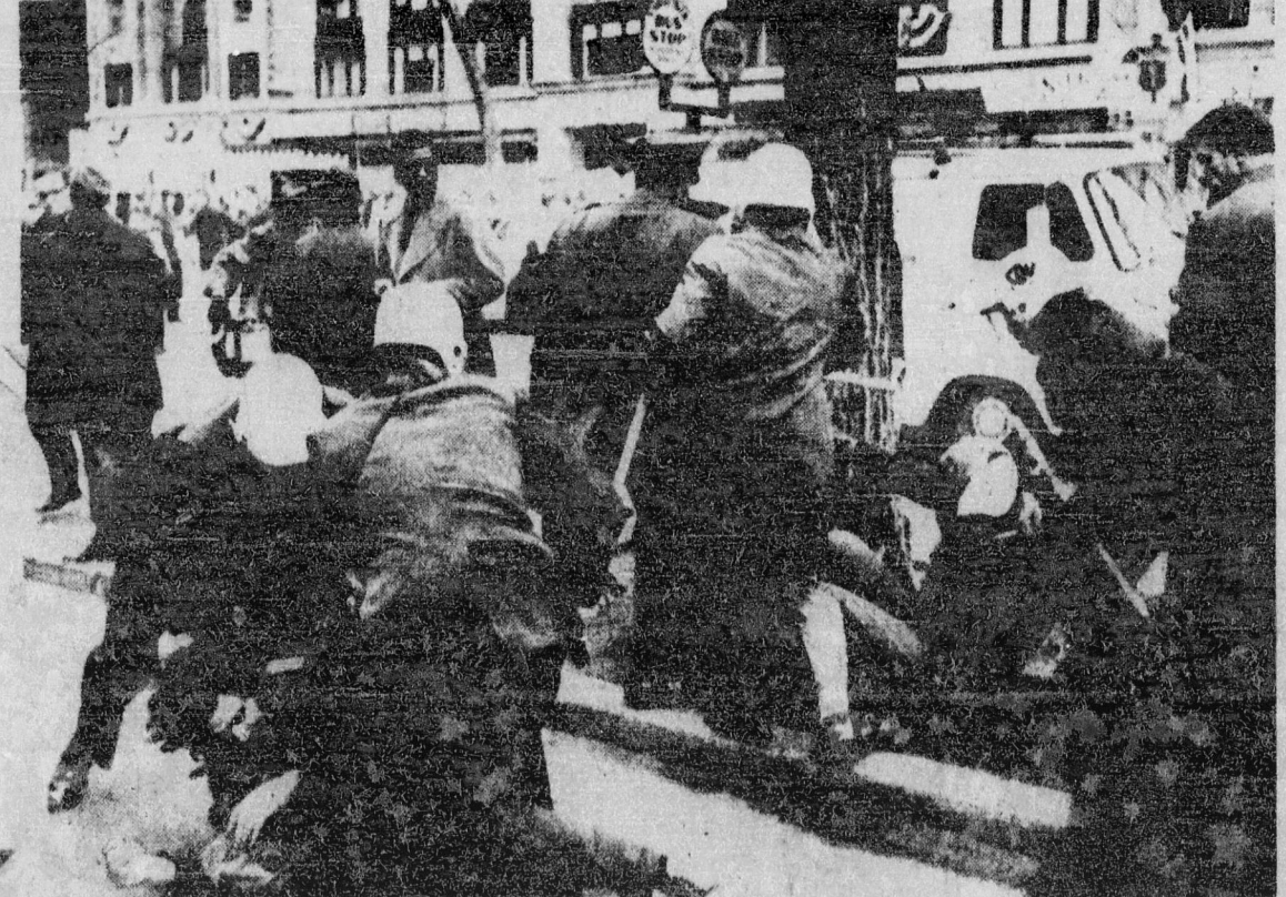
DEMONSTRATORS MAR INAUGURAL - Washington: Police scuffle with demonstrators January 20 a few blocks from the route of President Nixon's Inaugural Parade. Earlier, protesters hurled missiles at Nixon's bulletproof limousine and shouted obscenities.