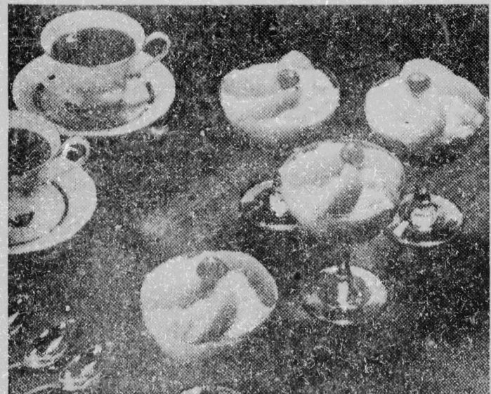
PEACHY RICE PUDDING (Makes 6 servings)

Delight guests with an easy-to-do dessert. Make Peachy Rice Pudding from ingredients handy on your kitchen shelf. Velvety evaporated milk keeps it delectable and extra-nutritious. Guests love it.