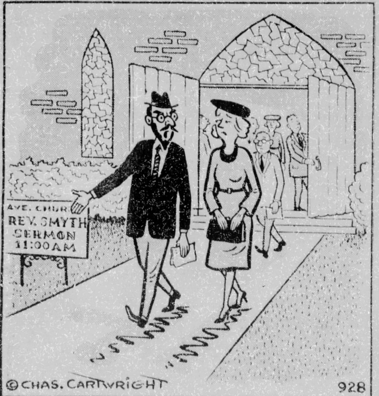
"It's NOT my imagination! For some reason he always looks straight at me whenever he mentions Satan!"