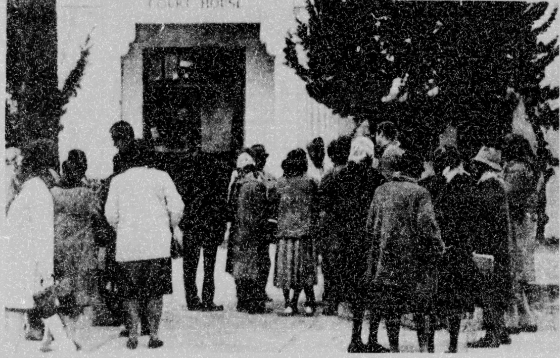
AID FOR THE POOR—Beaufort, S. C.: Eighty-three of 203 eligible families on March 3 picked up free federal food stamps offered for the first time to combat widespread malnutrition in two South Carolina counties. The poor lined up at the Beaufort County Courthouse to obtain the aid.