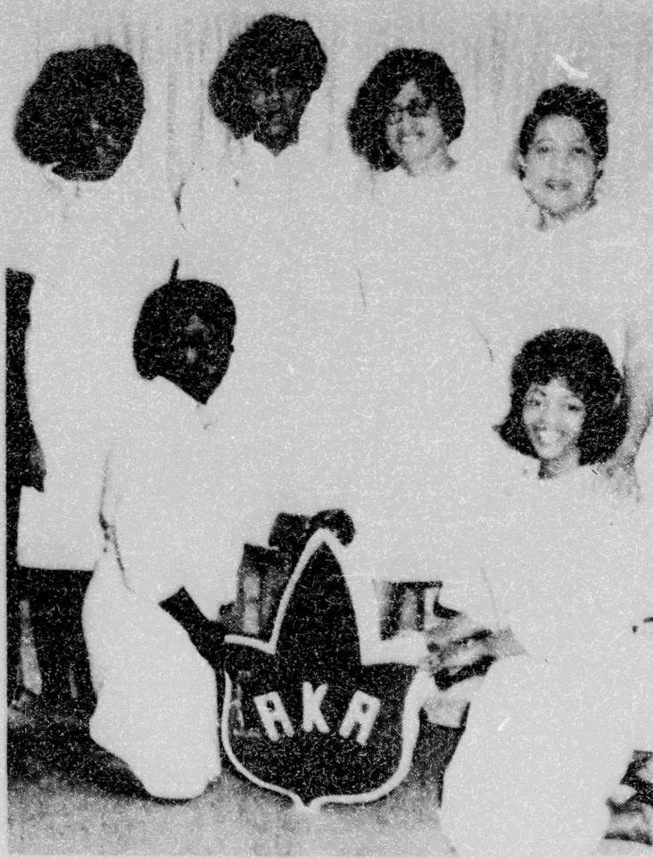
AKA'S IN FAYETTEVILLE INDUCT SIX -

On Sunday, March 23, at the Downtowner Motor Inn, Azalea Room, the chapter met to evaluate its program of "Service Unlimited" to senior citizens; to finalize plans for the Charn School for teenagers, and to seek ways of rendering more service in the community. The highlight of the meeting was a panel discussion entitled,