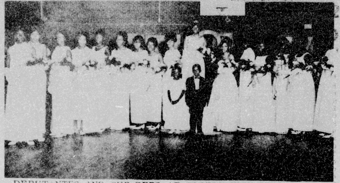
DEBUTANTES AND SUB-DEBS AT COOPER HIGH SCHOOL, CLAYTON. (See story).