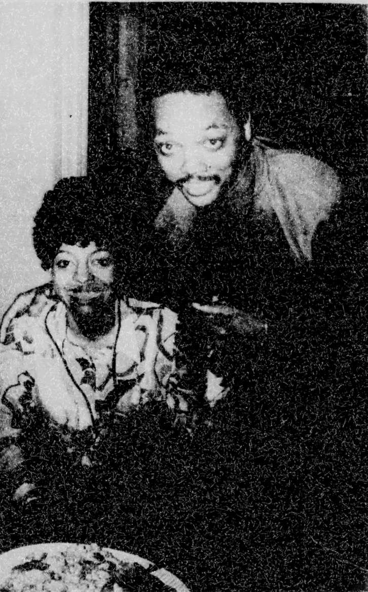
STARS OF PULPIT AND STAGE —Singer Diana Ross does a bit of frolicking over a dish of soul food with the Rev. Jesse Jackson, national director of SCLC's Operation Breadbasket. Rev. Jackson had invited the Motown entertainment star along with Supremes Mary Wilson and Cindy Birdsong to his Chicago home for a soul food dinner, prepared by his grandmother. Miss Ross and the Supremes had attended Rev. Jackson's regular Saturday Morning Breadbasket meeting before joining the dynamic young minister and his family for dinner.