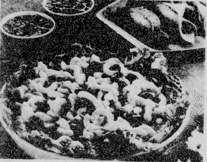
SPRINGTIME MACARONI SALAD (Makes 8 to 10 servings)

Tempt appetites with Springtime Macaroni Salad. Velvety evaporated milk keeps it moist and delicious. Serve it outside where everything tastes even better. A platterful of rolled cold cuts and cheese and ice-cold soft drinks make this menu sure to please.