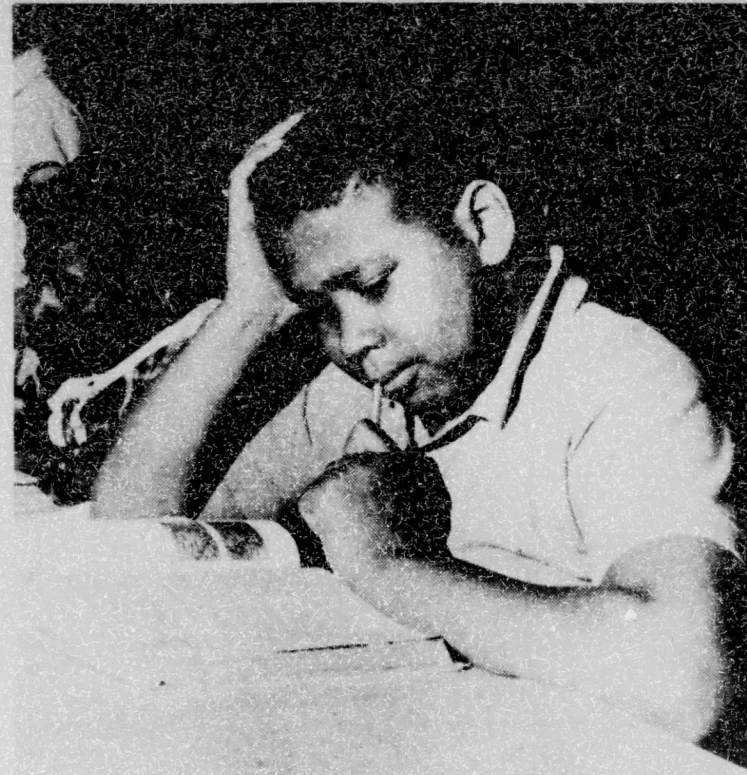
TUTORIAL SERVICE is offered at Delaware State College, Dover, Delaware.

FREEDOM OF CHOICE PTICH WASHINGTON - Sen. John Tower (GOP, Texas) has called upon the Department of Health, Education and Welfare to adopt a new policy on school desegregation which