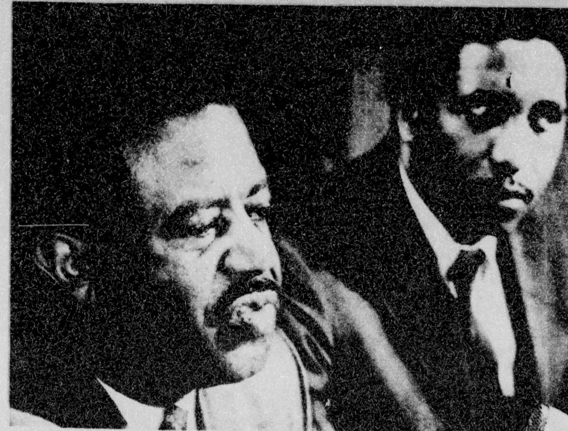
MEMORIAL SERVICES IN MEMPHIS —Memphis, Tenn.: Sen. Edward Kennedy and Rev. Ralph Abernathy are seated on the speakers platform during memorial services for Dr. Martin Luther King here April 4. At left is a horse collar with a likeness of King inset, symbolizing the poor people's campaign.