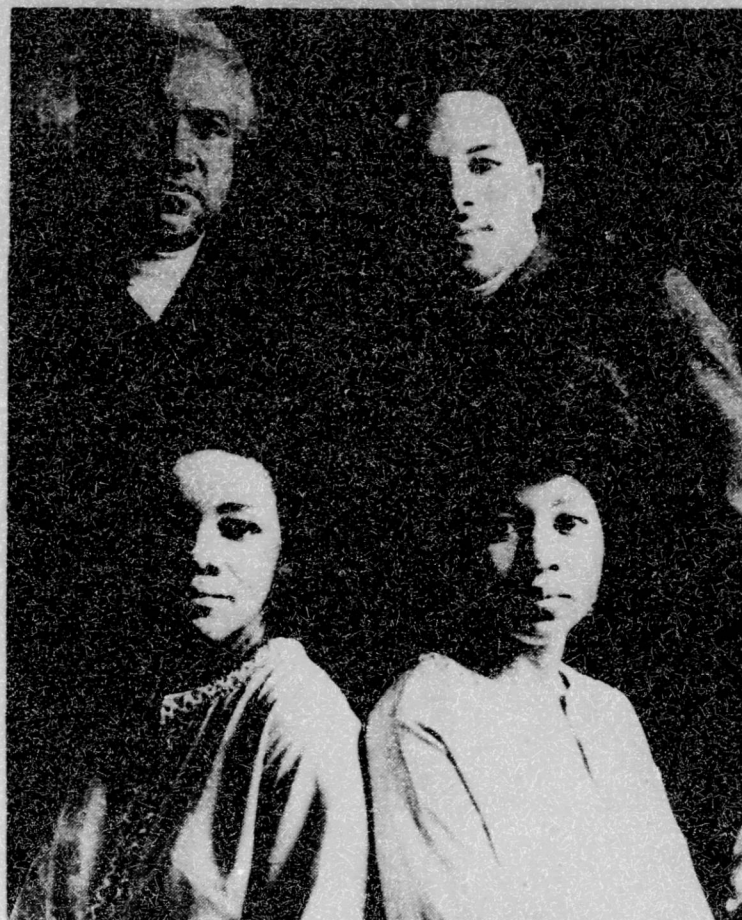
PRE-CONCERT GET TOGETHER - The famous Staple Singers get together prior to headlining Scholarship Concert at Auditorium theatre, Chicago, May 10. A talented family group, they are (from left, standing) Roscoe "Pop" Staple, and son, Pervis, who manages group. Seated are daughters Cleotha and Mavis.