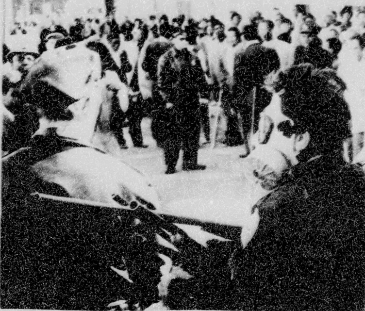
BLACK PANTHER WEAPONS CONFISCATED - San Francisco: A San Francisco Tactical Police sergeant carries out various weapons confiscated from Black Panther headquarters after it was raided April 28. Tear gas was used in the raid. Soon after this photo was taken violence began as the crowd became angered by the sight of the weapons being taken away.